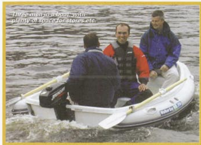
Three men in a boat, with plenty of space for stores etc.