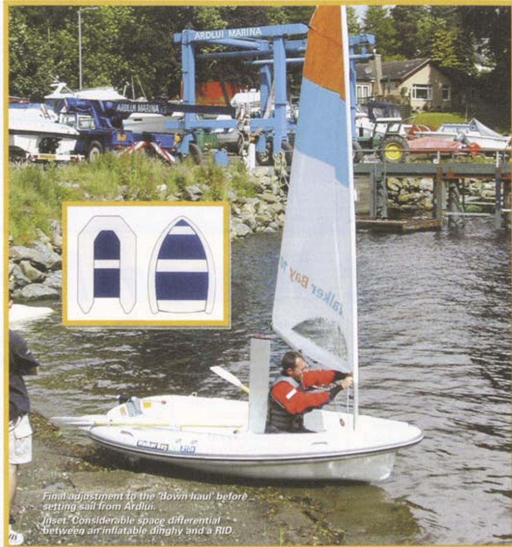
Final adjustment to the 'down-haul' before setting sail from Ardlui. Inset: Considerable space differential between an inflatable dinghy and a RID.